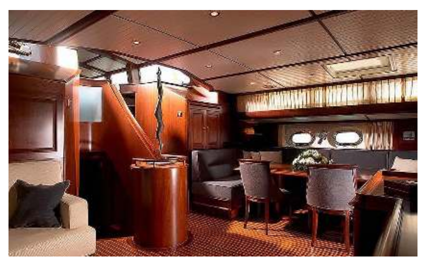
Example of the traditional but yet modern interior finish contemplated for this yacht.

Steve Doyle Apollo Yachts steve@apolloyachts.com www.apolloyachts.com