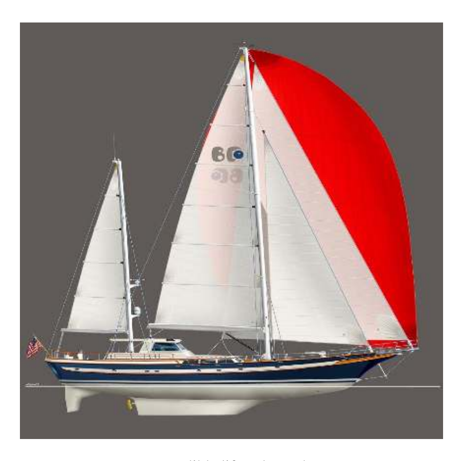
Incredible lifestyle on the water.

Rendition of the Blue Pearl 114, a classic clipper ketch with romantic overtones made with some of the finest engineering materials. The Blue Pearl 114 will sail safely and well offshore.